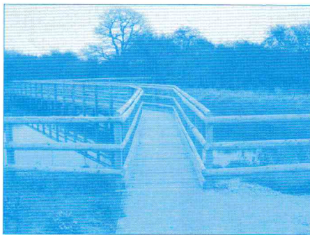
The Alder Pond boardwalk