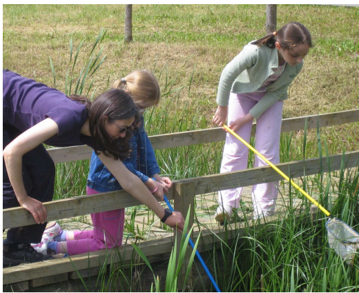
Pond dipping during Nature Quest