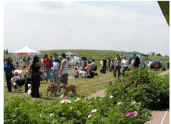
Crowds gather at Paws in the Park 2007

Over 40 children took part in the quiz and many enjoyed the craft activities in the pavilion. New members were enlisted and offers of help for future events were made. Ice creams were licked and burgers eaten and everyone had a wonderful time. Even the sun shone on what turned out to be probably one of the hottest days of the summer.