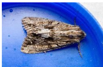
Pale Shouldered Brocade

Despite the weather we identified 14 species, some of them new to the park list and it was an entertaining night out!