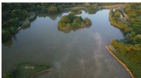
A great recently taken drone photo of the lake at the Wick Country Park.

It was certainly a busy day and both the Friends of the Wick Country Park and Wickford Wildlife Society had many visitors to the presentation resulting in new members joining.