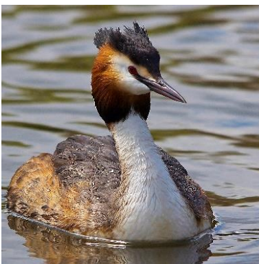
Great Crested Grebe

The wildlife picnic took place on Saturday 24 th June and it turned out to be a very pleasant day. We were lucky in that the weather, while hot, was cloudy and kept the blazing sun off us. Some wildlife was seen, including a single Great Crested Grebe on the lake. Is the other Grebe sat on a nest somewhere? Fingers crossed that we do get breeding grebes at the lake this year. Nice also to see a few Swifts flying around the lake and a couple of Buzzards overhead too.