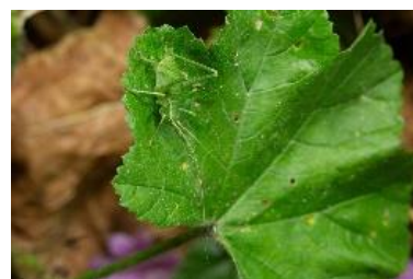
Speckled Bush Cricket